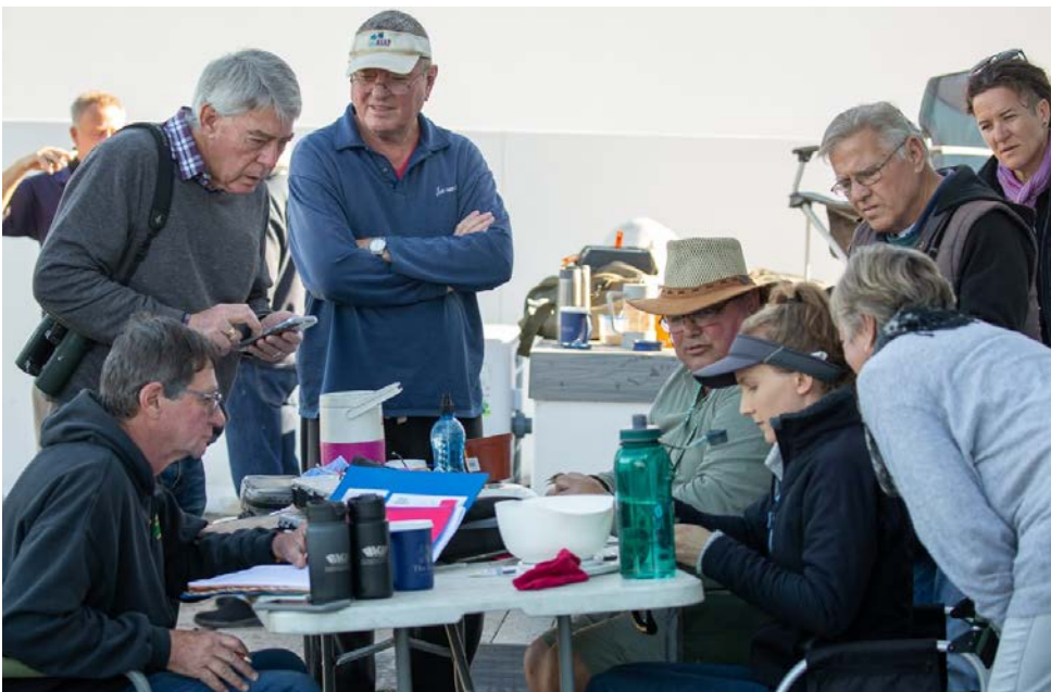
Caption: Always more to learn